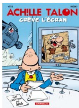
Achillon Talon crève l'écran