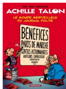
Le Monde merveilleux du journal Polite