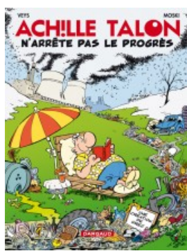
Achille Talon n'arrête pas le progrès