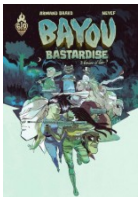
BAYOU BASTARDISE - Tome 3 - Blind will tell