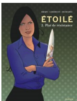
Plat de résistance