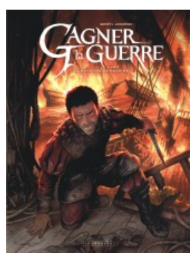
Le Royaume de Ressine