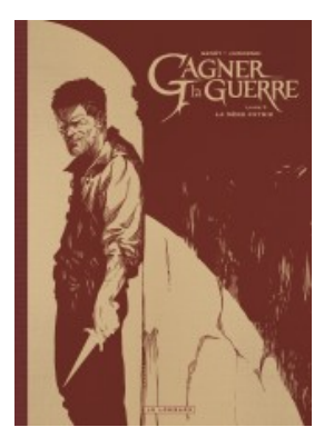
La Mère patrie