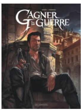
La Mère patrie