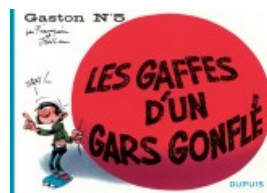
Les gaffes d'un gars gonflé