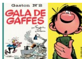
Gala de gaffes