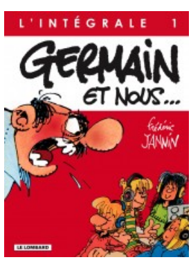
Germain et nous -Intégrale T1