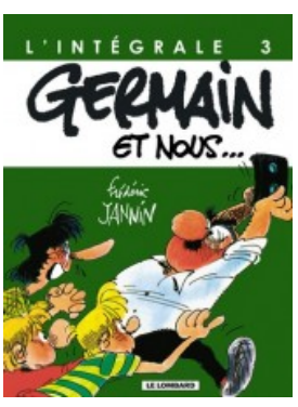
Germain et nous -Intégrale T3