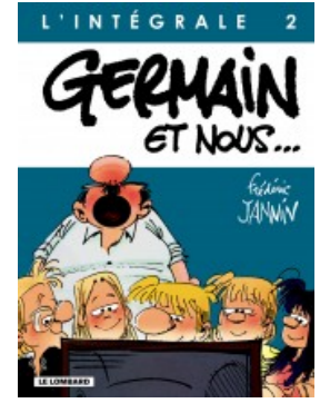
Germain et nous -Intégrale T2