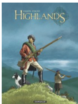
Highlands - Intégrale complète