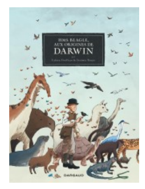
HMS Beagle Aux origines de Darwin