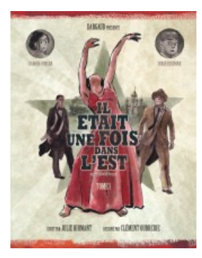
Il était une fois dans l'Est