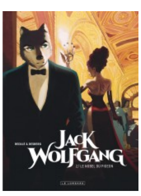
Le Nobel du pigeon