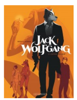
L'Entrée du loup