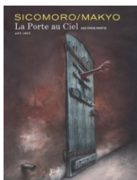
La Porte au ciel - tome 2