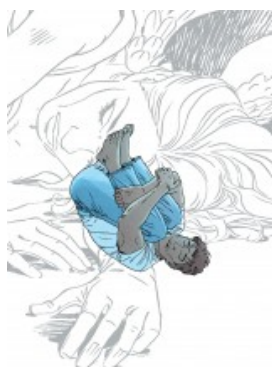
La frontière de la nuit