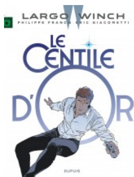
Le Centile d'or