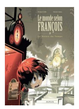
Le Maître du Temps