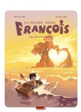
Les amants éternels