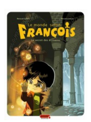
Le secret des écrivains