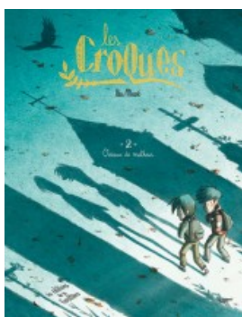
LES CROQUES T2- OISEAUX DE MALHEUR