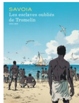
Les esclaves oubliés de Tromelin