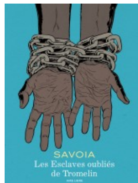
Les esclaves oubliés de Tromelin