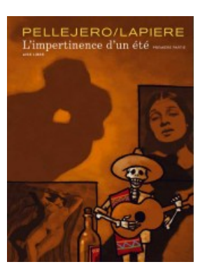
L'impertinence d'un été tome 1/2