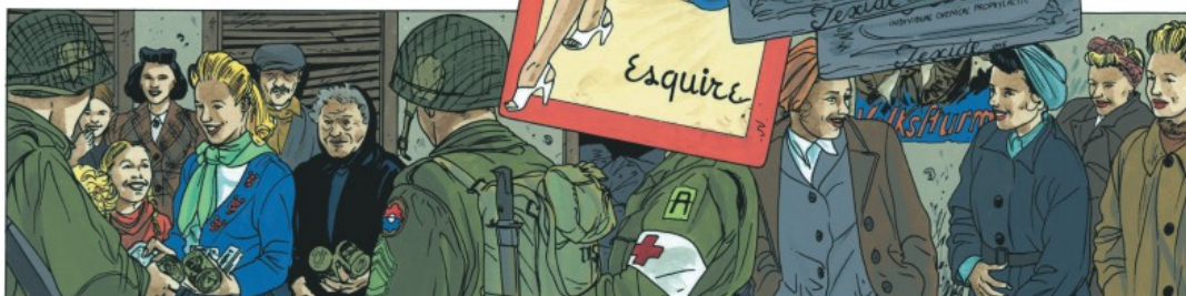
25 FÉVRIER 1945 - OPÉRATION "GRENADE" (ATTACHE DE LA ROER À KÖLN). 5 MARS 1945, ENTRÉE DANS KÖLN DU II E BATAILLON DU 32 E ARMORED REGT ET DU I ER BATAILLON DU 36 E INF REGT. POPULATION DE LA VILLE RÉDUITE À 25 000 HABITANTS (POUR 700 000 AVANT-GUERRE).