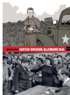
Cartier-Bresson Allemagne 1945