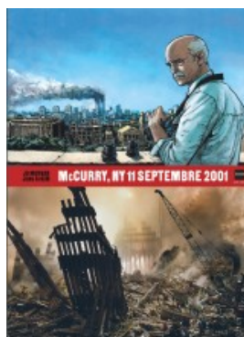
McCurry NY 11 septembre 2001