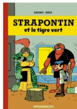
Strapontin - Intégrale