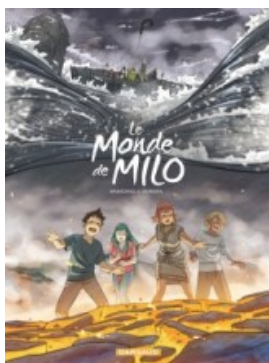
Le Monde Milo - Tome 10