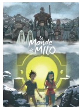
La Terre sans retour - tome 1