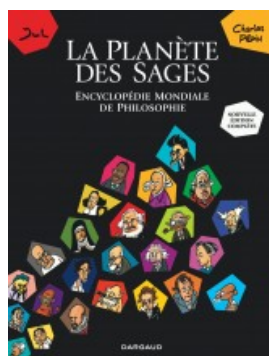
La Planète des sages - Intégrale