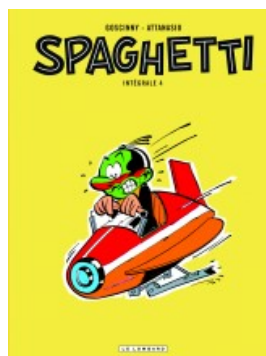
Intégrale Spaghetti 4