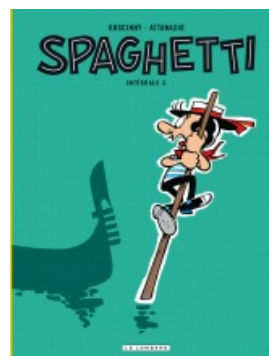
Intégrale Spaghetti 3