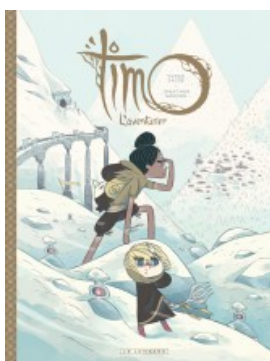
Timo l'Aventurier tome 2