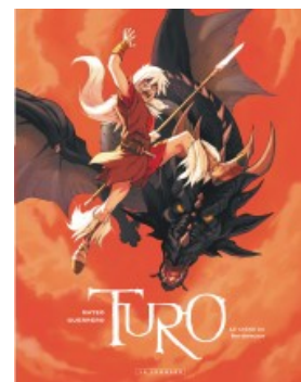
Le Crâne du Roi-Sorcier