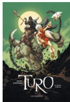
Le Cœur d'Helos