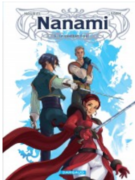
Le Combat final