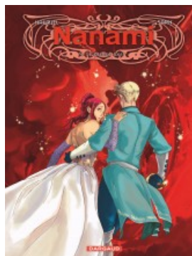
Le Prince noir