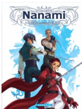
Le Combat final