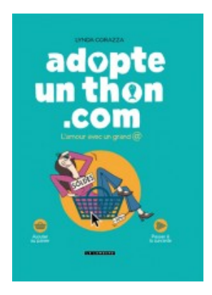
L'amour avec un grand @