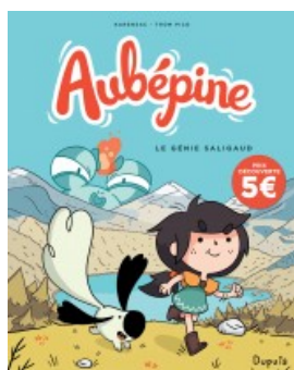
Le Génie Saligaud