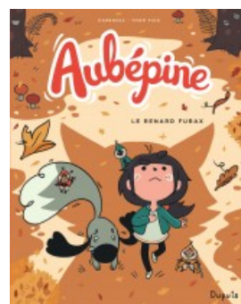
Le renard furax