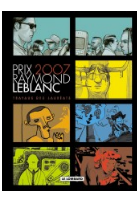
Album Fondation Raymond Leblanc 2008