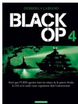
Black Op - tome 4