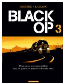
Black Op - tome 3