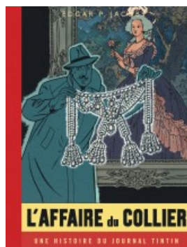
L'Affaire du collier