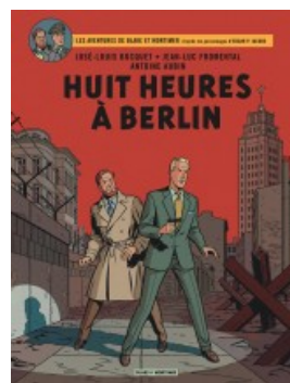
Huit heures à Berlin