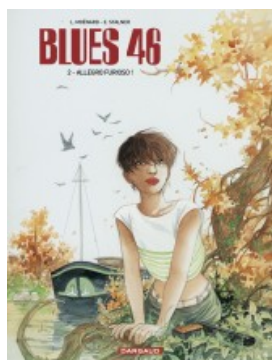
Allegro Furioso !