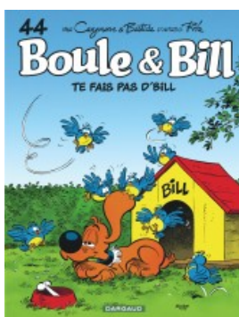
Te fais pas d'Bill !