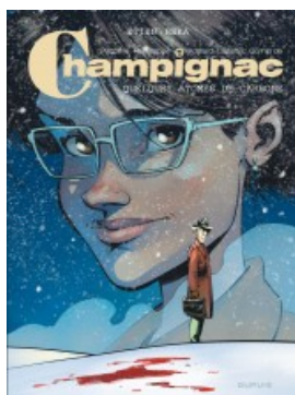
Quelques atomes de carbone