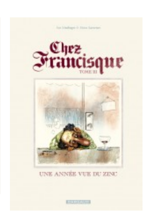
Une année vue du zinc