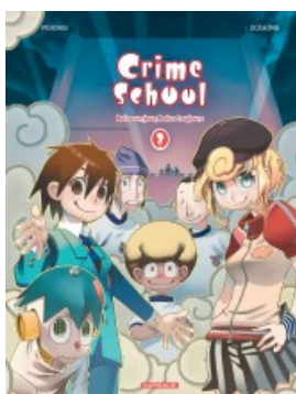
Bolos un jour bolos toujours