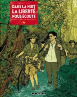
Dans la nuit la liberté nous écoute