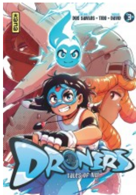
Droners – Tales of Nui T3