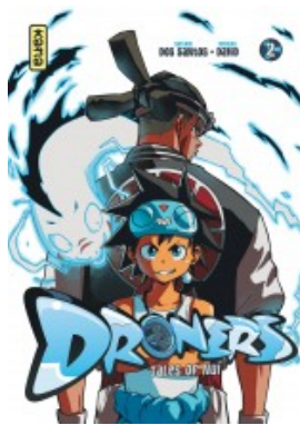
Droners – Tales of Nui T2