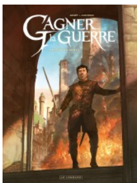
Retour en grâce