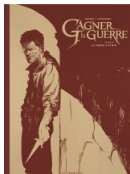
La Mère patrie