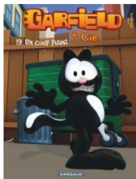
Un coup puant