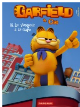
Le Vengeur à la cape