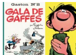
Gala de gaffes