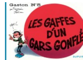
Les gaffes d'un gars gonflé