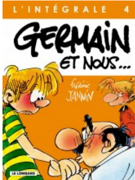
Germain et nous - Intégrale T4