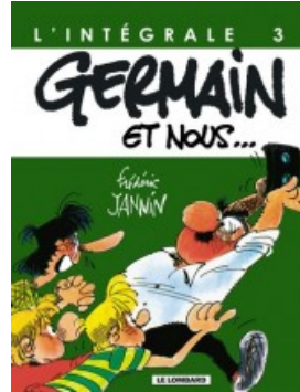
Germain et nous - Intégrale T3