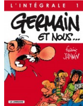
Germain et nous - Intégrale T1