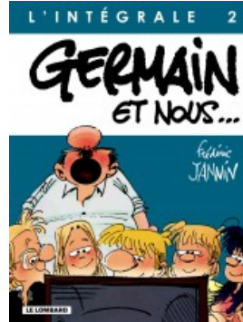
Germain et nous - Intégrale T2