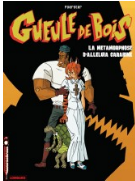
La Métamorphose d'Alléluia Carabine