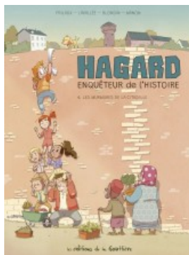
Les Murmures de la citadelle