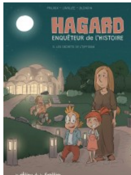
Les Secrets de l'Oppidum