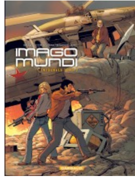
Imago Mundi intégrale 2