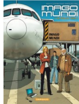
Imago Mundi intégrale 1