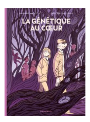
La Génétique au coeur