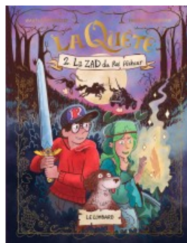
La ZAD du roi pêcheur