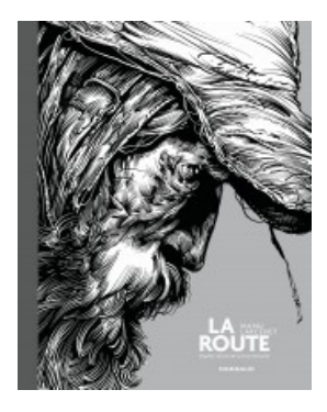
La route (Noir & Blanc)