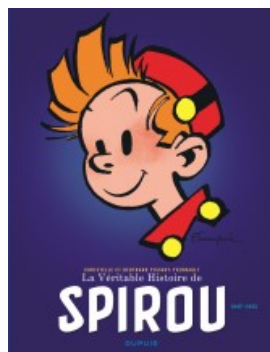
La Véritable Histoire de Spirou (1947-1955)