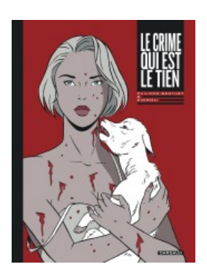
Le Crime qui est le tien