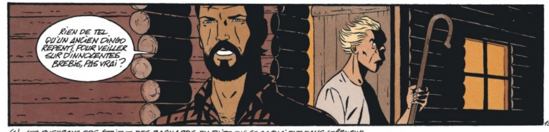
(1) LES BUSURANGERS ÉTAIENT DES BABNARDS EN PUITE QUI SE CACHAIENT DANS LE BUSH". POUR LES CHASSER, LES AUTORITÉS AUSTRALIENNE'S EMPLOYAIGNT DES INDIGÉNES.